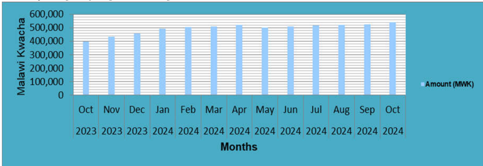
Graph showing monthly average for the cost of living