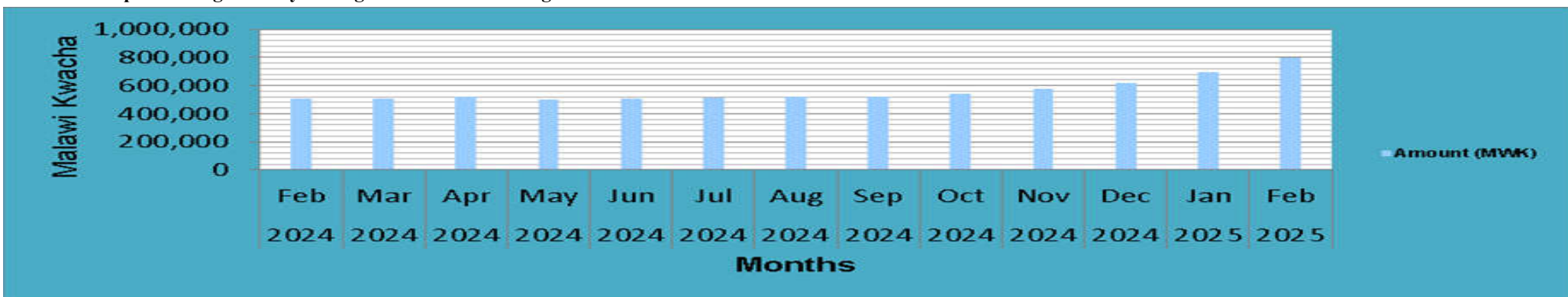
Graph showing monthly average for the cost of living