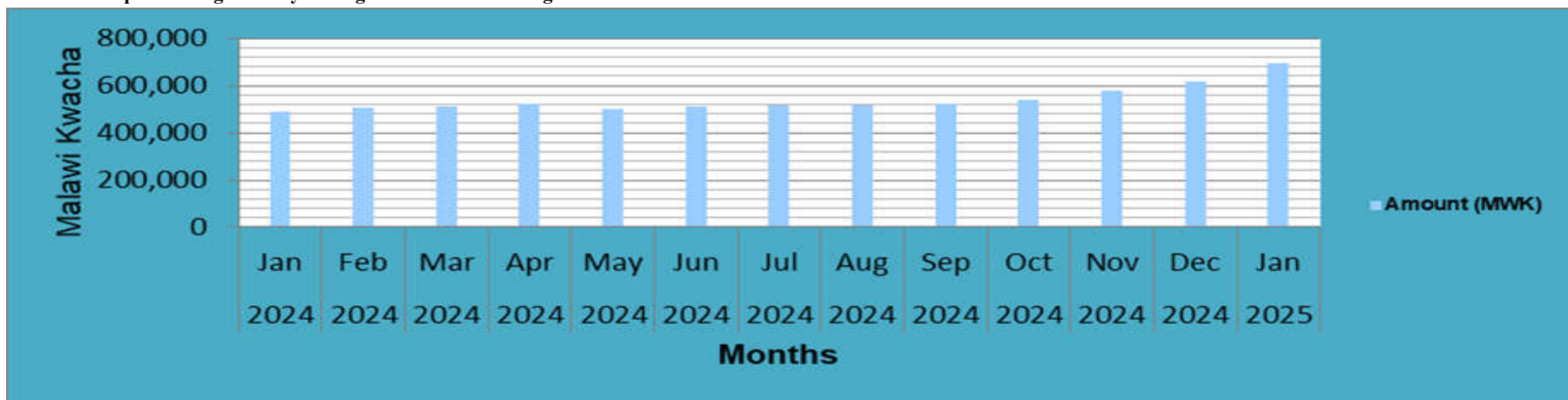
Graph showing monthly average for the cost of living