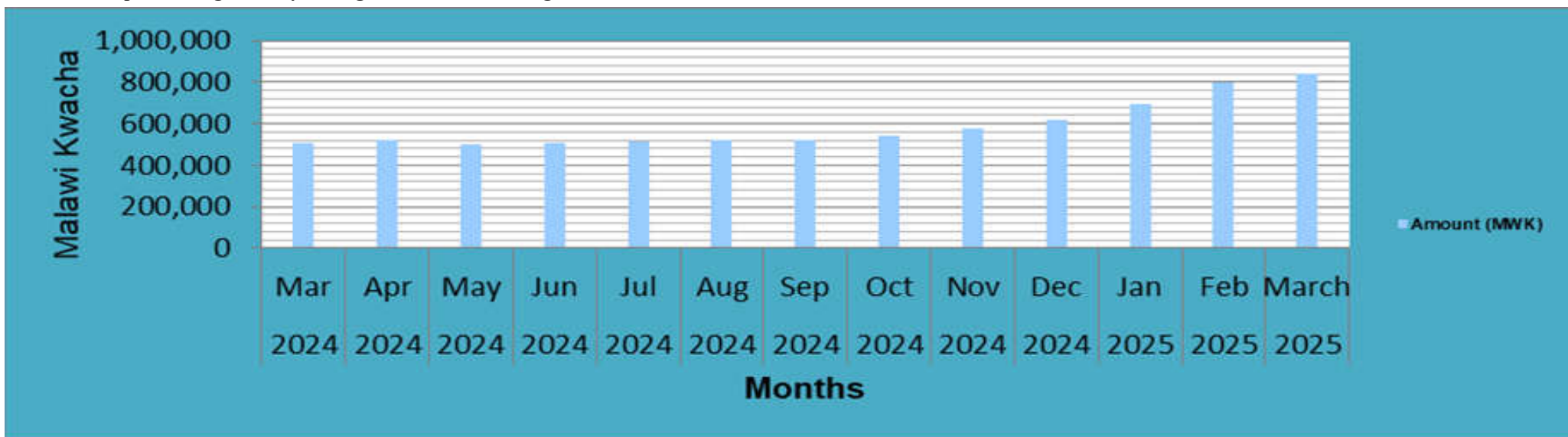
Graph showing monthly average for the cost of living