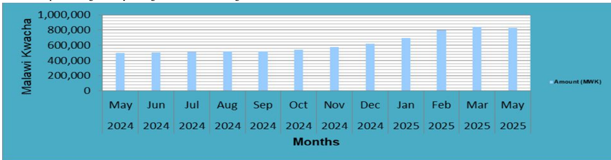
Graph showing monthly average for the cost of living